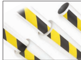
barrier arms available in aluminum/wood or plastic with optional foam padding