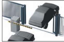
automatic p.a.m.s. sequencing with slide and swing gates