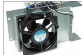
fan/heater kits options available for extreme weather conditions